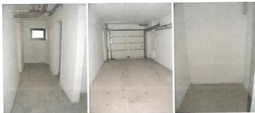
Parter-hol +garaj + boxa