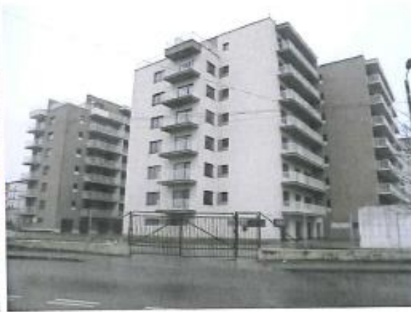
Vedere generala: Tronson I + Tronson II