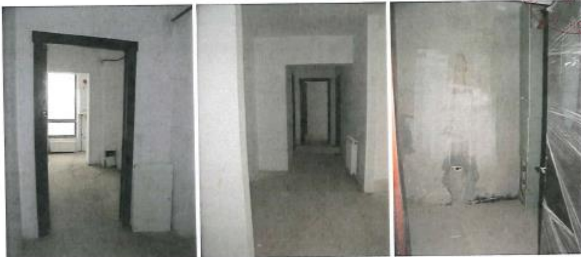
Etaj 7-Ap. 37