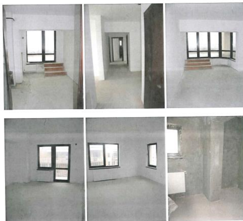
Etaj 7-Ap. 40