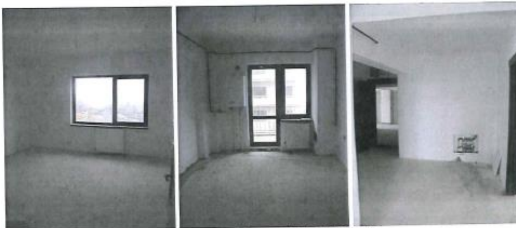
Etaj 5-Ap. 29 – idem ap. 5; 11; 17; 23; 35