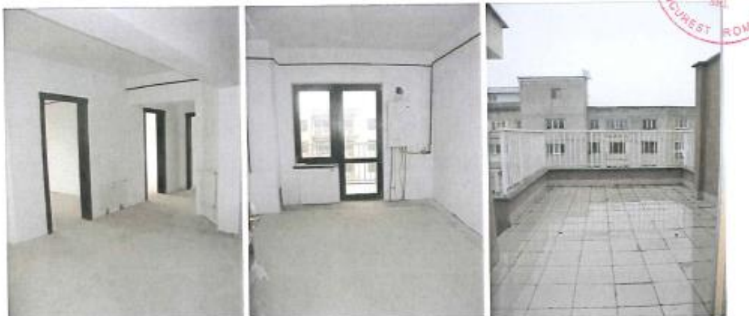
Etaj 7-Ap. 37