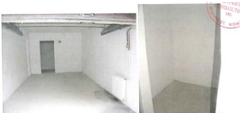
Parter-garaj + boxa