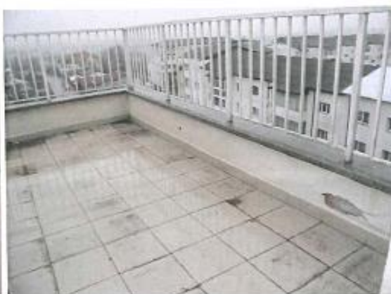
Etaj 7-Ap. 40