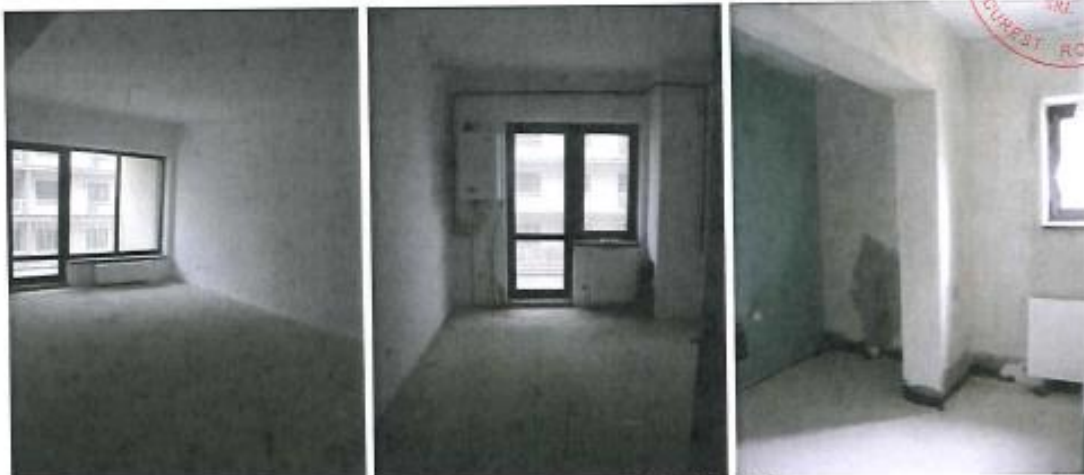
Etaj 4-Ap. 22 – idem ap. 4; 10; 16; 28; 34