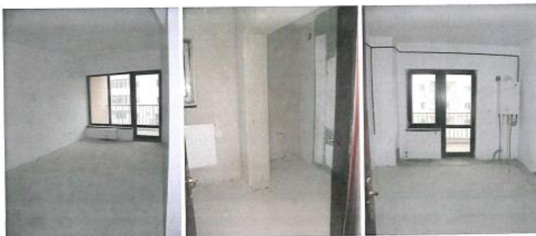
Etaj 2-Ap. 9 – idem ap. 33; 27; 21; 15; 3