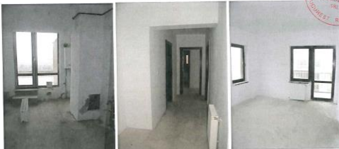
Etaj 7-Ap. 39