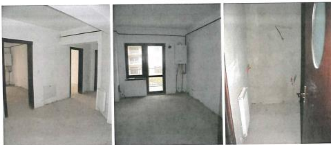
Etaj 1-Ap. 1 – idem ap. 31; 25; 19; 13; 7;