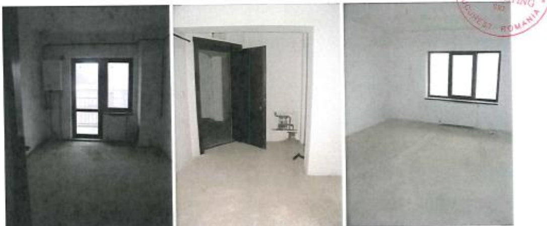
Etaj 1-Ap. 1 – idem ap. 7; 13; 19; 25; 31