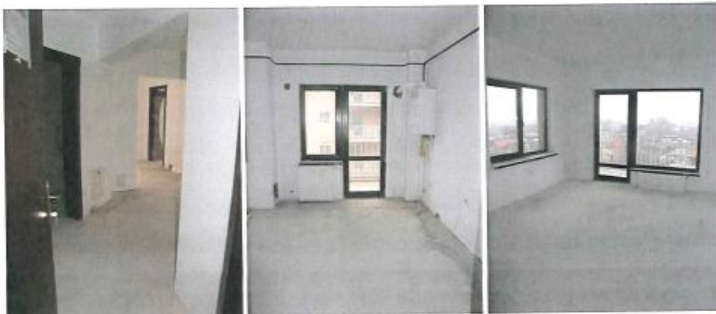
Etaj 5-Ap. 29 – idem ap. 35; 23; 17; 11; 5