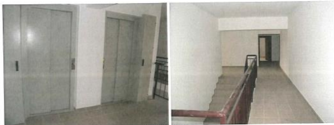
Etaj 7-Lift + hol