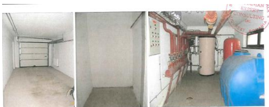
Parter: garaje + boxe + camera centrala