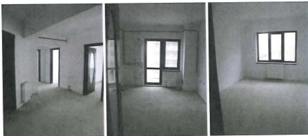
Etaj 3-Ap. 15 – idem ap. 3; 9; 21; 27; 33