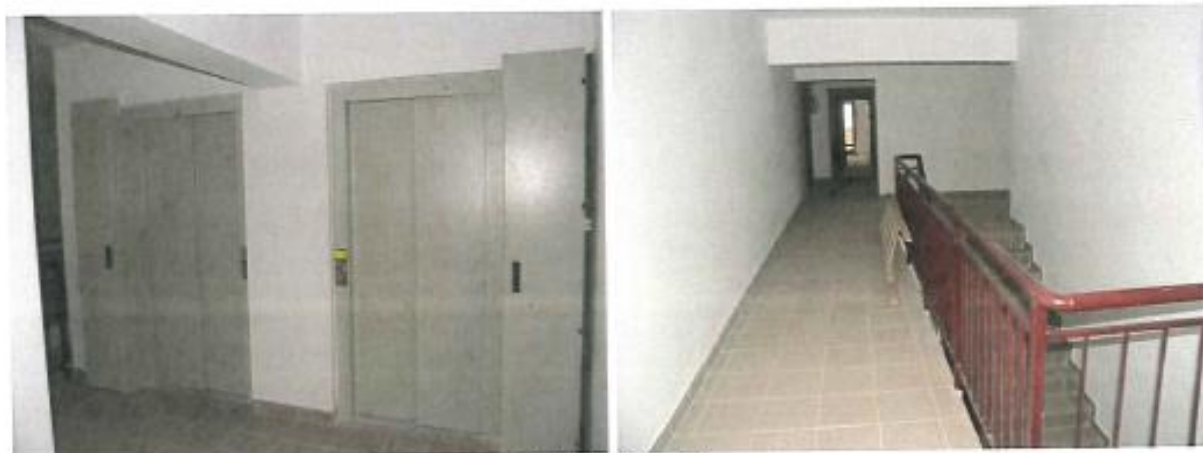
Etaj 7-Lift + hol