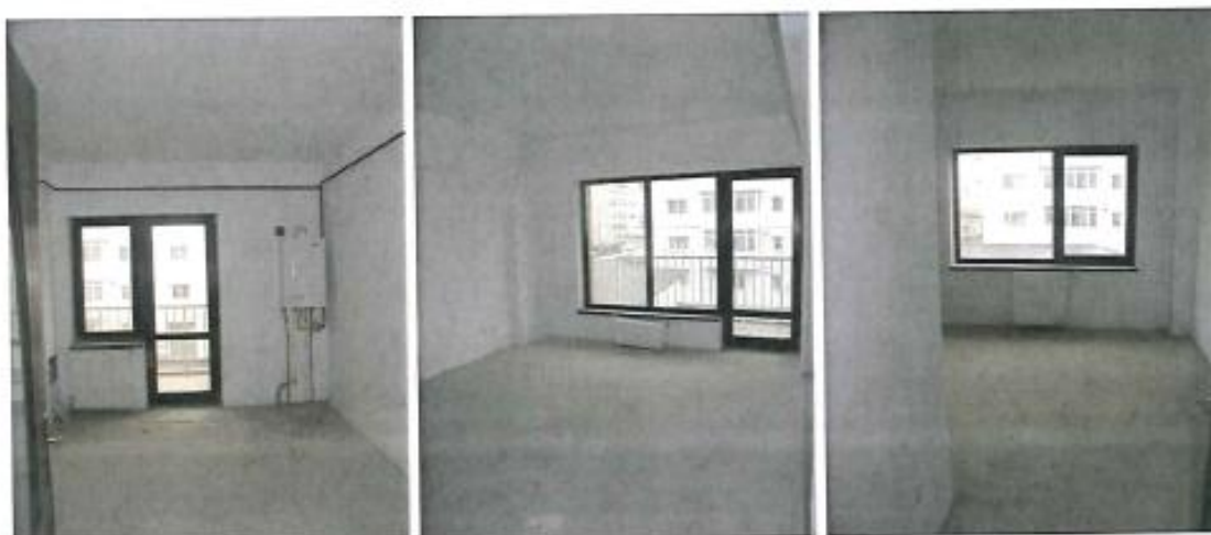
Etaj 2-Ap. 8 – idem ap. 32; 26; 20; 14; 2