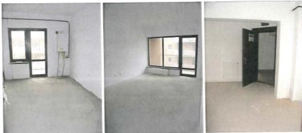
Etaj 6-Ap. 36 – idem ap. 30; 24; 18; 12; 6