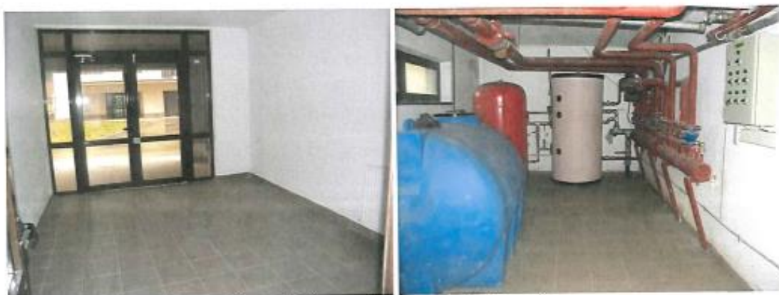
Parter-hol intrare + camera centrala termica