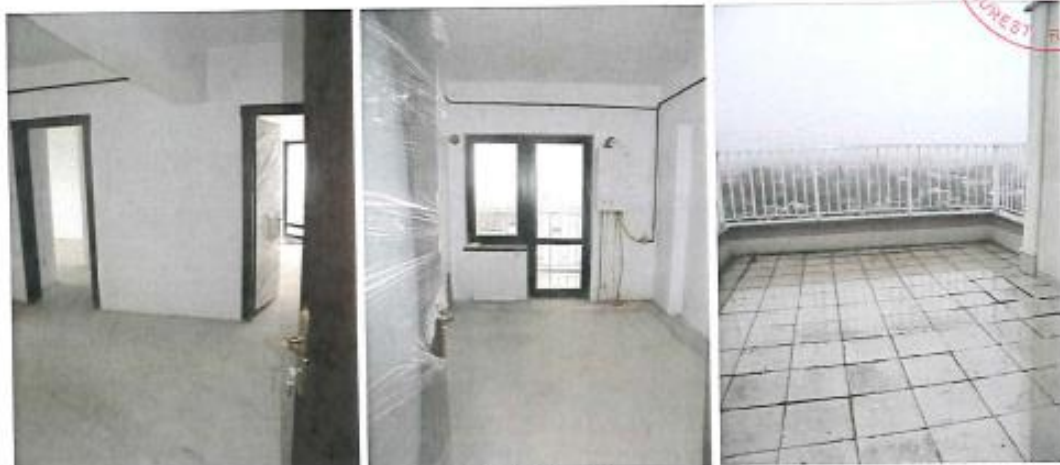
Etaj 7-Ap. 39