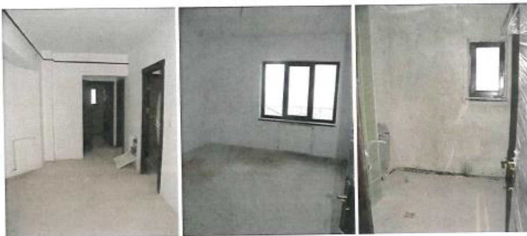
Etaj 6-Ap. 36 – idem ap. 6; 12; 18; 24; 30