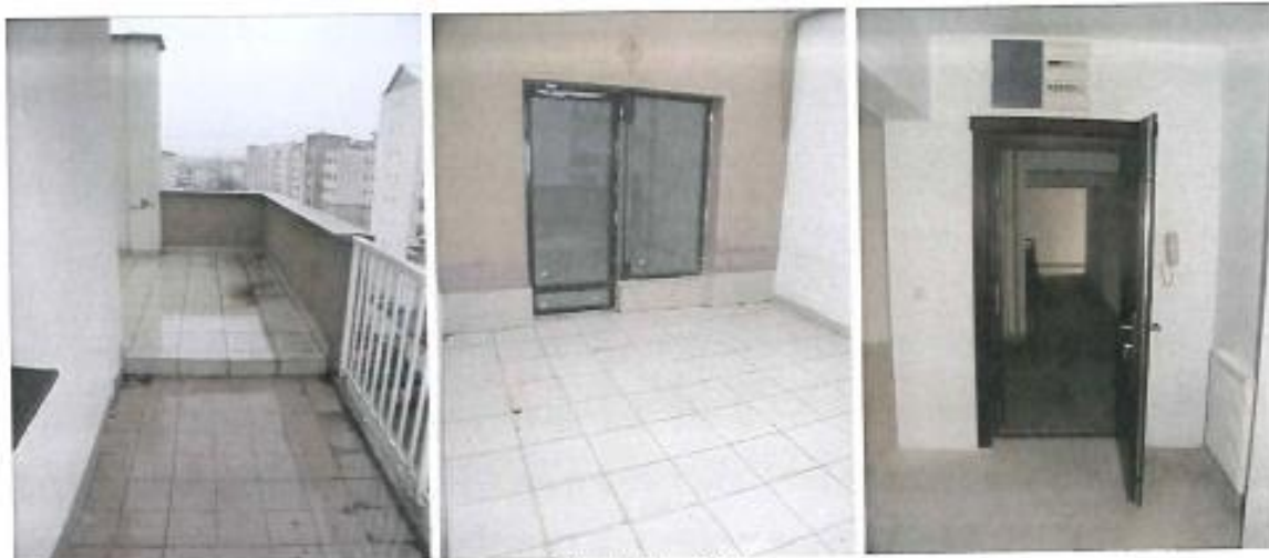
Etaj 7-Ap. 38