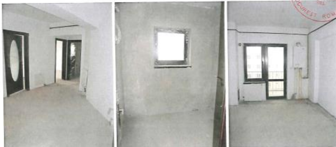
Etaj 4-Ap. 22 – idem ap. 34; 28; 16; 10; 4